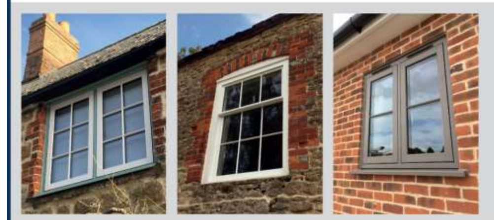
We take pride in every project, delivering on time with a friendly approach to all our customers.

: 07879 016 386 : info@paulpoundsglazing.co.uk : www.paulpoundsglazing.co.uk